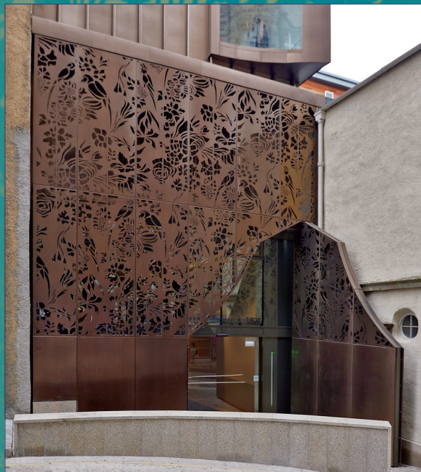
St Cecilia's Hall entrance.

St Cecilia's Hall, Niddry Street, Edinburgh EH1 1LJ The auditorium at St Cecilia's Hall dates from 1763 and is the oldest concert hall in Scotland and the second oldest in Britain.